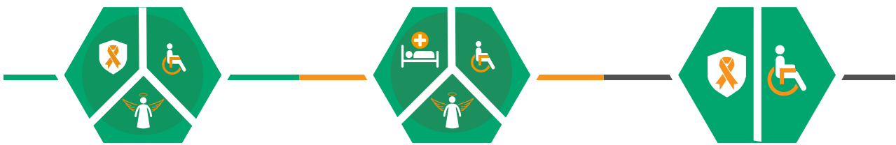
China Life Enhanced Payer Benefit Rider

You can choose to complement your plan with any of our riders: