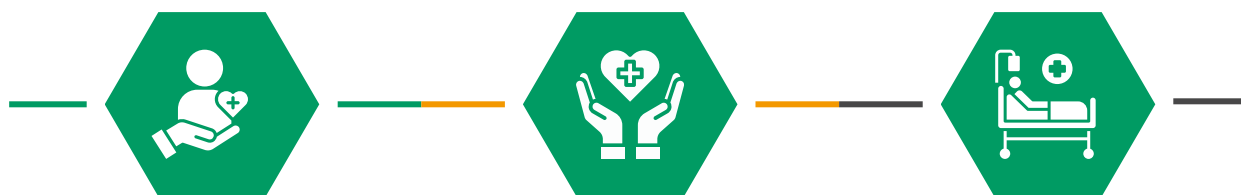
China Life Enhanced Payer Benefit Rider

There are multiple ways to personalise your cover to suit your needs. You can choose to complement your plan with any of our riders.